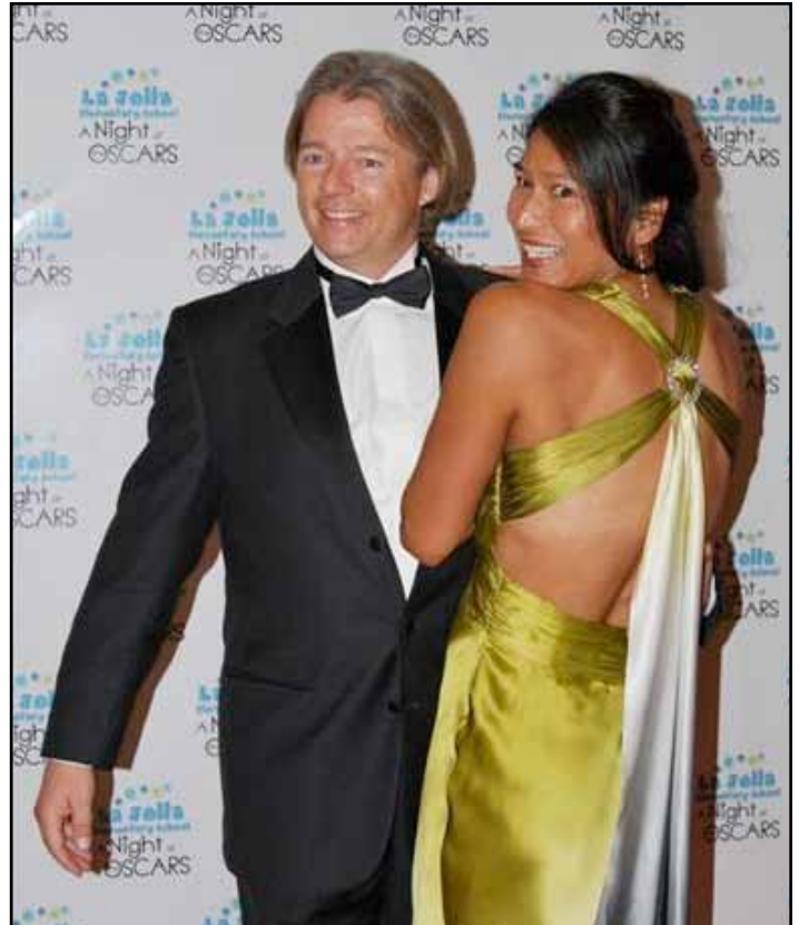
"A Night at the Oscars" gave parents a chance to dress up and walk down the red carpet, literally. See page 5 for more photos.