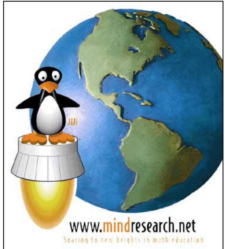
Meet Jiji the penguin, above, who stars in a new mathematics software program that has just arrived on campus. Ask your children about him. Left, the school Safety Patrol works on Girard Avenue each morning, helping students and parents cross the street safely. Soon, 5th grade "Morning Greeters" will be helping out during Marine Street drop-off as well.