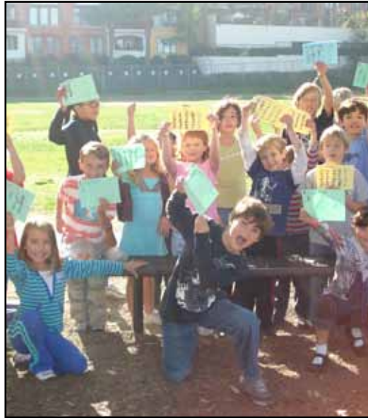
Students in Run Club hold up their mileage cards at the stamp station.