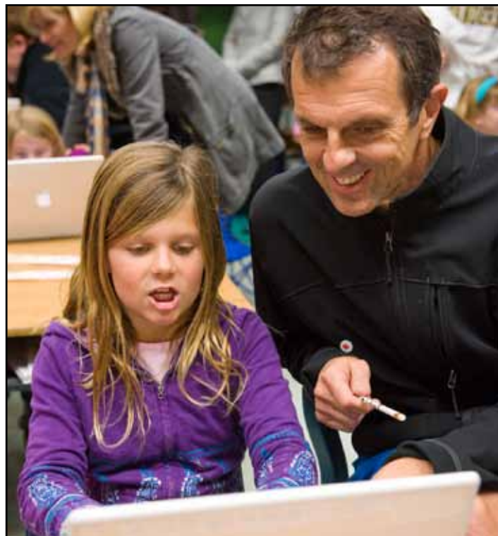
Fun With Computers