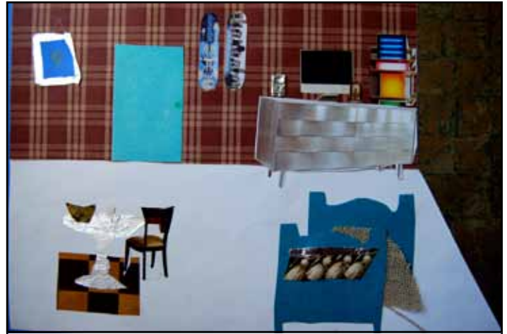
Every student will have one piece of art featured in the annual art show, held May 20 and 21 in the auditorium.