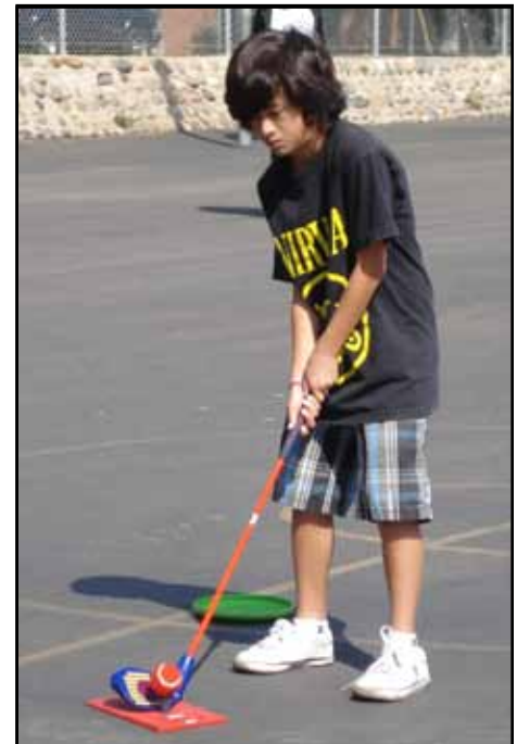
Golfing is just one of many activities that students have been doing in P.E. lately.

Make sure to visit the Open Aire Market for all of your Memorial Day needs. We've got grass-fed beef for BBQ's, fresh tomatoes and avocados for salsa, kettle corn, local strawberries, and much more! See you at the market!