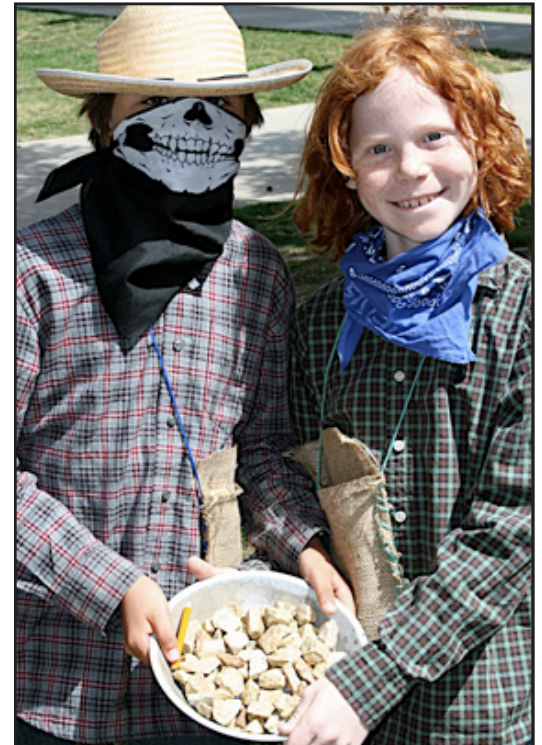
Where's the gold?

4th graders dressed and acted the part of miners and prospectors during the recent '49er Day. See page 7 for more photos.