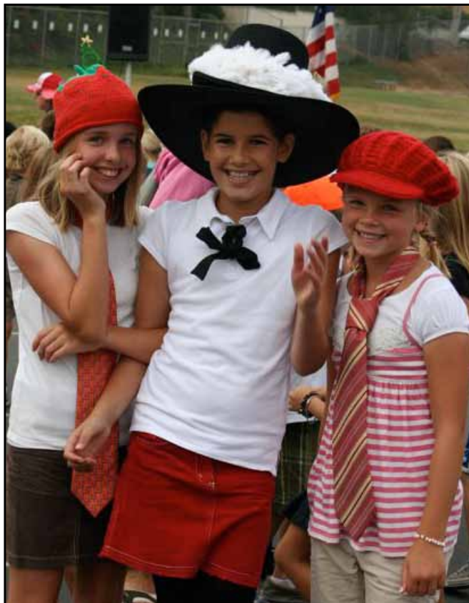
Fifth graders were full of smiles and laughter on Crazy Hat and Tie Day.

DO NOT LEAVE YOUR CAR UNATTENDED IN THE DESIGNATED PASSENGER DROP-OFF/PICK-UP LANE ON MARINE STREET. Lots of people have been doing this in the morning, and it really messes up the drop-off process. Please park your car somewhere else if you have to walk your child into school. If you see your friends do this, please remind them not to.