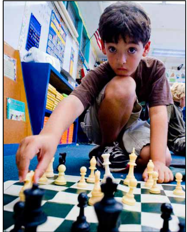
After School Fun