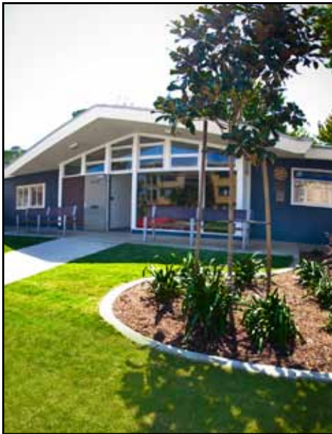
The Marine Street entrance to the school was transformed over the summer by BLOOM.